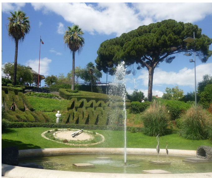
CATANIA – Villa Bellini

The second largest city in Sicily by population, Catania spreads out over the Plain of Catania, between the Ionian Sea and the slopes of Etna. 2,700 years of history, are the scenery for a daily unique performance.