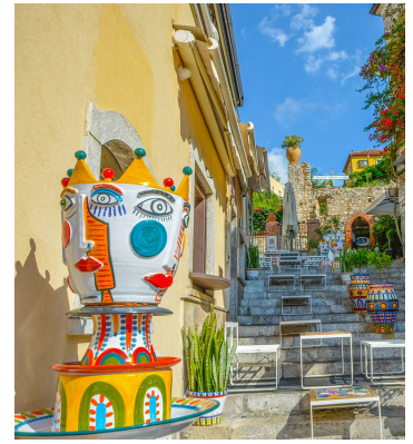
TAORMINA - Scalinata

There are many noble residences, like the wonderful Palazzo Corvaja, Palazzo dei Duchi di Santo Stefano, and the churches, every one built with a peculiar architecture style, from Chiesa dei Cappuccini to Chiesa di San Pancrazio that was built on the rests of a Hellenistic temple.