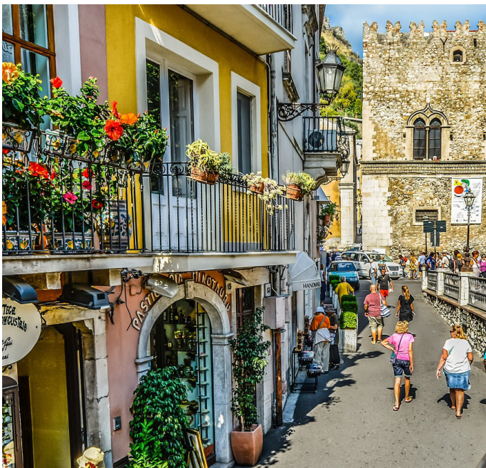
TAORMINA - Corso Umberto

Welcome lunch in the hotel restaurant or a gourmet restaurant; after lunch, guided walking tour through Taormina.