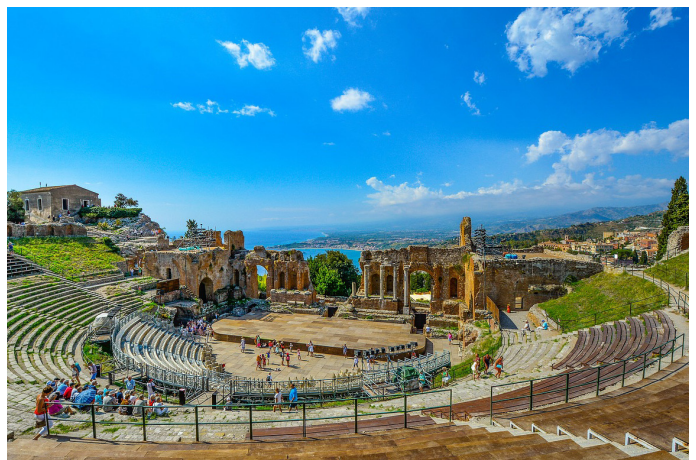
TAORMINA - Greek theater

Aperitif and dinner on the terrace of a gourmet restaurant with sea view