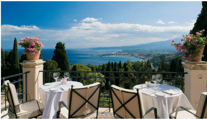
Amazing view from the hotel

Check in at the Hotel 5* situated in front of the Roman-Greek Theatre with sea and Etna view; it dates back to 1873 and represents an elegant 19th century residence inherited from the grand Sicilian nobility.