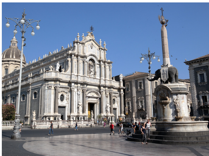
CATANIA – Piazza Duomo

Catania, due to its splendid location on the seaside and to its temperate climate, was since VIII century B.C. subsequently conquered by several dominators: Greeks, Romans, Goths, Byzantines, Arabs, Normans, Swebians, French, Spanish, and Austrians who have all left their “footprints”, in the form of beautiful buildings. We will visit the morning fish market in the heart of the city. Norman Castello Ursino, wanted by Frederick II of Swabia in 1239.