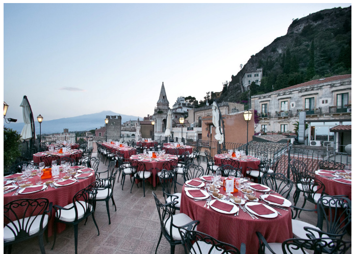
TAORMINA - A restaurant with a view