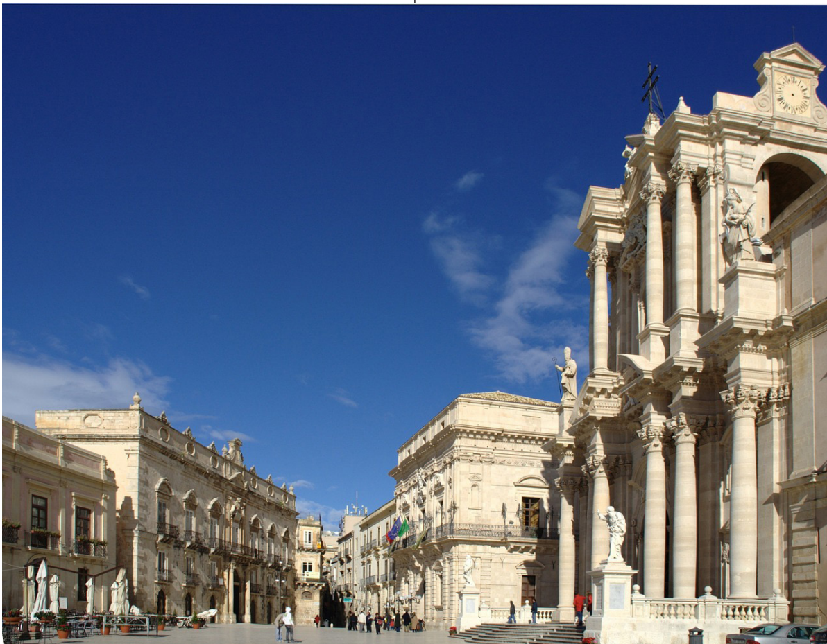
ORTIGIA - Piazza Duomo