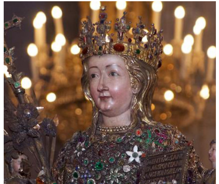
CATANIA – Sant'Agata