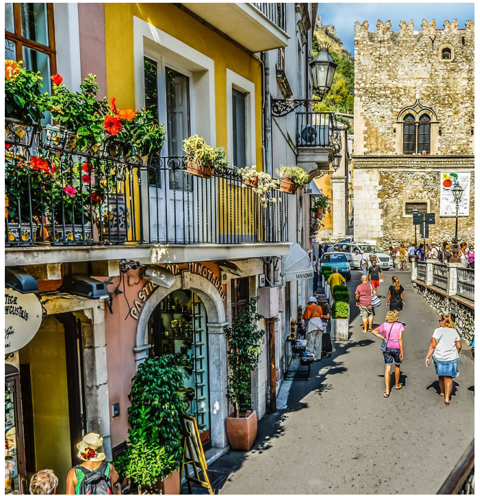
TAORMINA - Corso Umberto

beauty, traces of the Byzantine domination and beautiful villas which belonged to the European aristocracy in the XVIII and XIX centuries, all in the context of a small town on top of the hill, overlooking the coastline of the Ionian Sea.