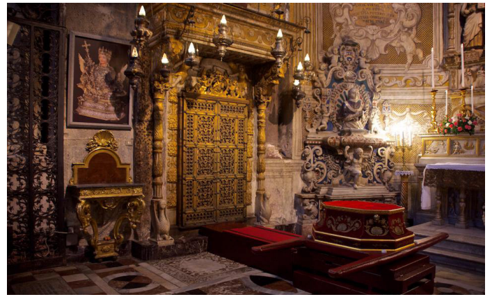
CATANIA – Basilica Cattedrale Sant'Agata V.M.

Gala Dinner in a private hall (10 person for each hall) with a private butler and balcony with a spectacular view of the procession of Sant'Agata.