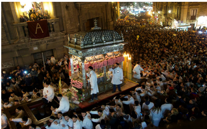
CATANIA – Sant'Agata