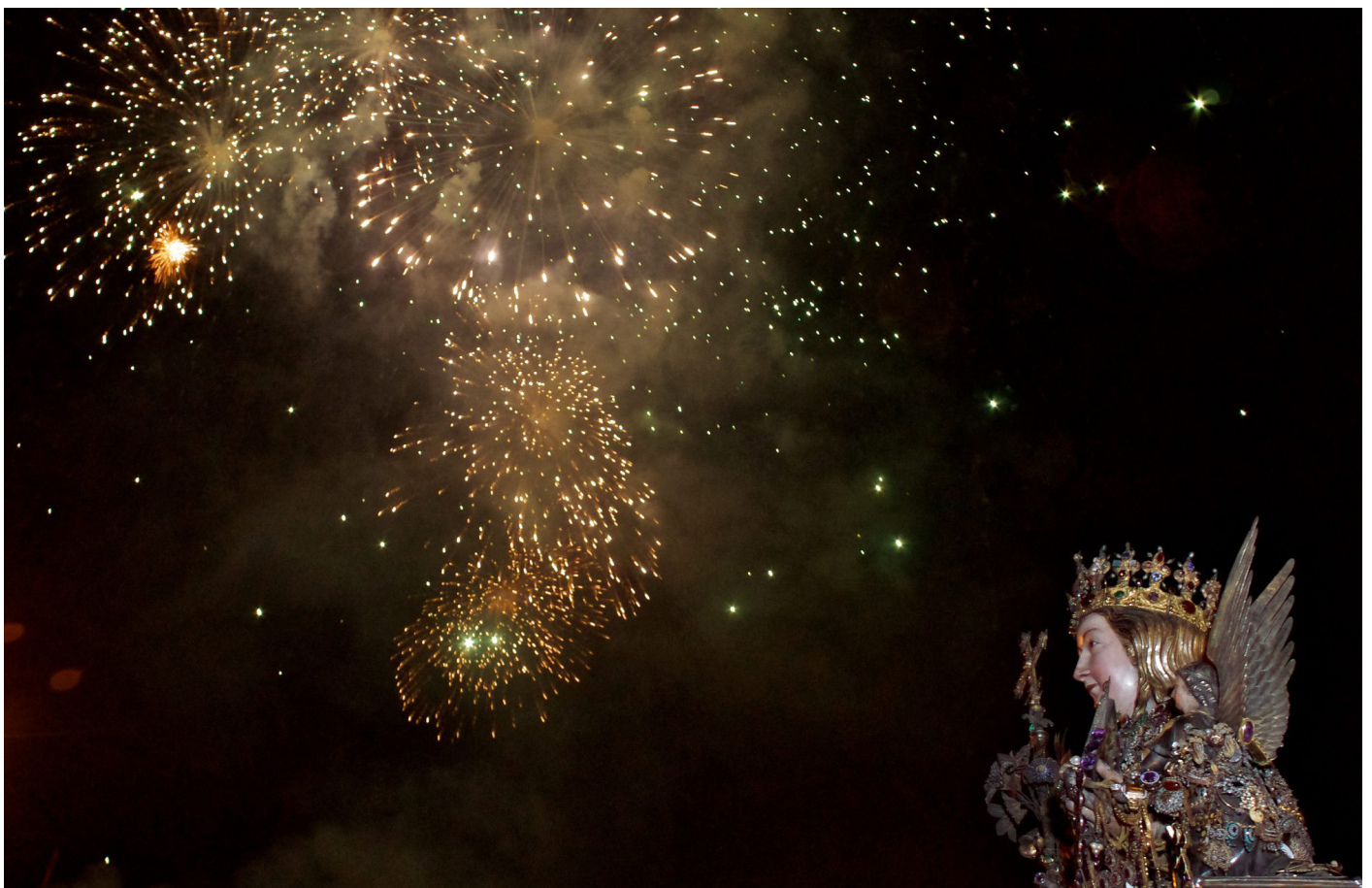
CATANIA – City center during the yearly celebration in honor of the Sant'Agata