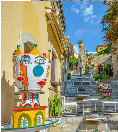
TAORMINA - Piazza IX Aprile