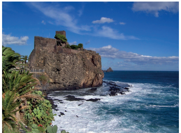
ACI CASTELLO – The Norman Castle