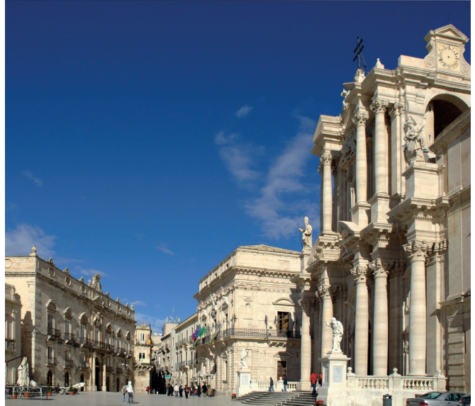
ORTIGIA - Piazza Duomo

In the afternoon the visit will start with the Archaeological Park of Neapolis, with its Greek Theatre, the Roman Amphitheater, the Latomie of Paradise and the Dyonisios "Ear" and it will continue with the visit of Ortigia , a small island which is the historical center of Siracusa. In Ortigia you will admire the amazing Cathedral and the famous Arethusa's Fountain.