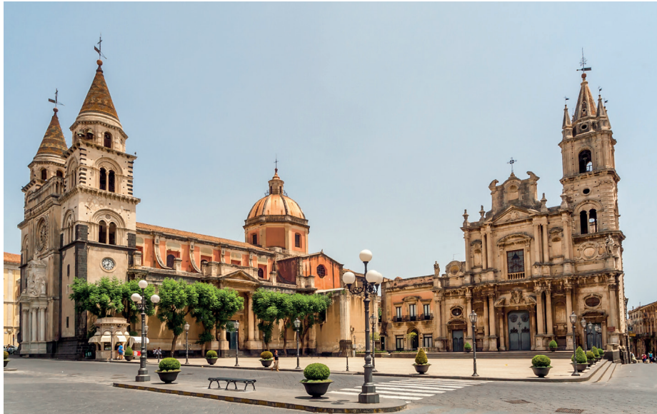
ACIREALE – Main square

Dinner and overnight in hotel in Acireale area.